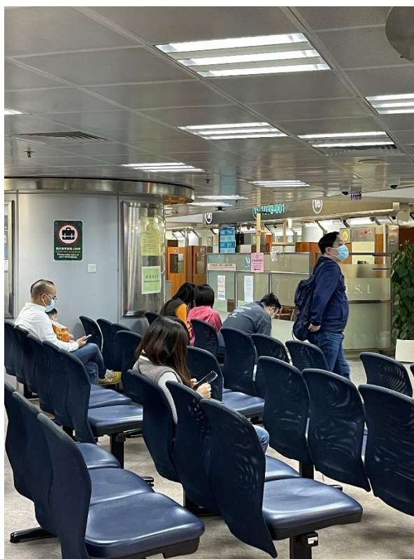
DSI at China Plaza in Avenida da Praia Grande opens to accept applications from 9 a.m. to 9 p.m. on Saturday and Sunday