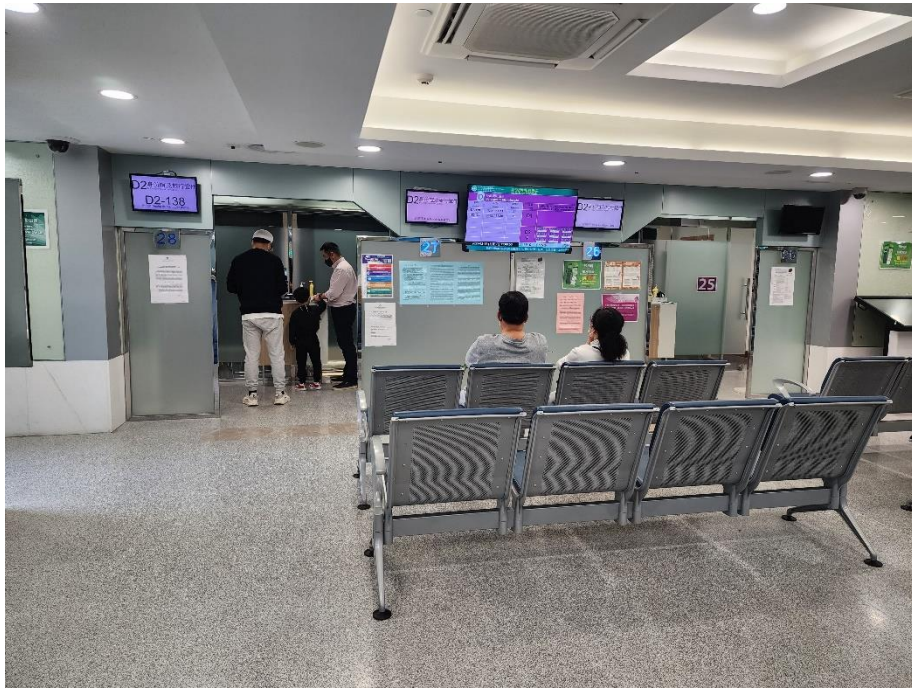
The Municipal Affairs Bureau sent officers to the Government Services Centre in Islands to support front-line counters on Saturday and Sunday