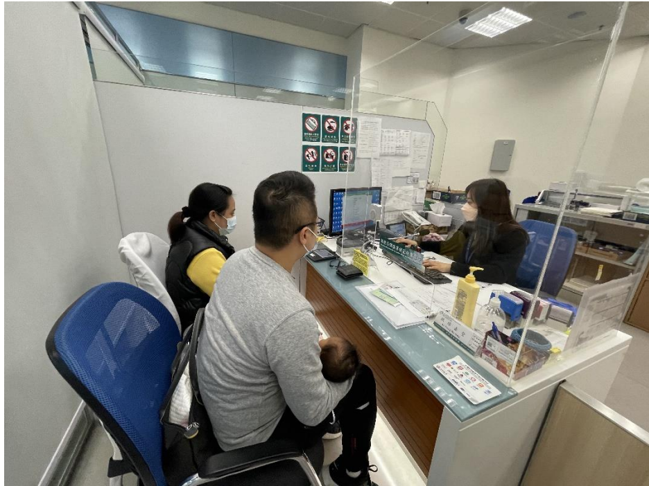
Citizens lodge application at DSI on weekend