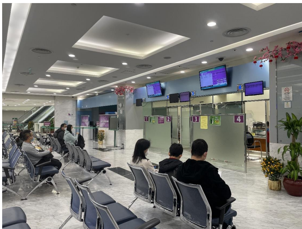
The Municipal Affairs Bureau sent officers to the Government Services Centre in Areia Preta to support front-line counters on Saturday and Sunday